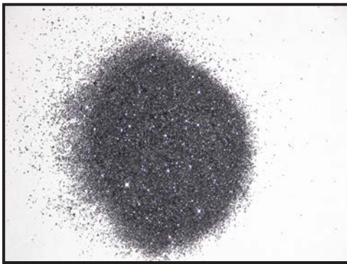
Powder Size: 100-500 \mu\text{m}

Using a special sample preparation technique and a new SIMS analytical protocol, individual SiC particles with a size ranging from 100 \mu\text{m} to 500 \mu\text{m} in a SiC powder sample can be analyzed. This innovative approach eliminates contributions from surface contamination to bulk concentration.