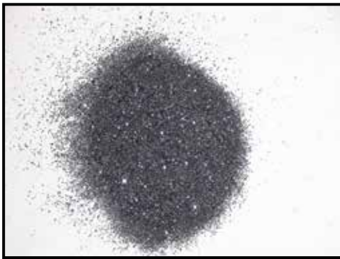
Powder Size: 100-500 \mu\text{m}

Using a special sample preparation technique and a new SIMS analytical protocol, individual SiC particles with a size ranging from 100 \mu\text{m} to 500 \mu\text{m} in a SiC powder sample can be analyzed. This innovative approach eliminates contributions from surface contamination to bulk concentration.