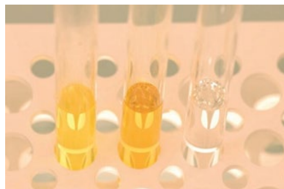
Fig. 2: Carius tubes filled with HCl + Fe(II) before (colorless) and after (yellow) reaction with Ce(IV). The orange color represents a higher concentration of Ce(IV)-sulphate.

Dissolution of the samples is required and has to take place under a fully inert atmosphere to prevent oxidation by oxygen from the air. Samples are dissolved in so-called carius tubes; glass tubes to which hydrochloric acid with a known amount of Fe(II)/Fe(III) is added. The tubes are closed by melting under argon atmosphere. Subsequently, the tubes can be heated up to 200°C to dissolve or decompose the samples. Figure 2 shows such carius tubes before and after reaction.